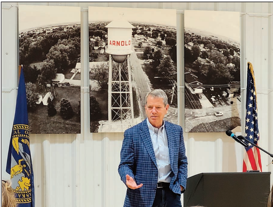
Against the backdrop of the Arnold water tower canvas print, Gov. Jim Pillen speaks to a crowd of about 60 on connecting the state last Thursday at the community center as part of his fly around to five communities.

The Governor said, “My first impression of Arnold is awesome. You’re keeping up the old buildings and bringing in new. Keep doing what you’re doing. Arnold is going to thrive, not because of us, but because of you.”