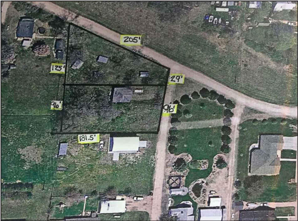
Using LB840 funds, the above map shows the surveyed real estate approved for purchase for future housing development in Arnold.

The AEDC Board said that if any funds are received from the future development of the lots, the proceeds will be placed back into the AEDC land account, which is monitored both by the AEDC and the Village to be used towards future land acquisition. According to Arnold's Economic Development Plan, sites and facilities may be sold or leased at a price at or below current market values. The target date to begin clean up of the property is June 2024, or sooner if possible.