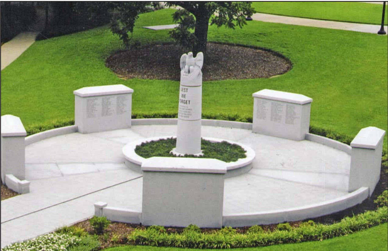
Pictured above is an image that will give everyone an idea of the layout of the planned Arnold Veterans Memorial at the intersection of Highways 92 and 40. The memorial will be in a circular pattern as shown, but the main wall will be different (pictured, above right). Legion Post 130 will be working with North Platte Monument Co. on the final design.

American Legion Post 130 is planning to build a veterans memorial on the corner of Highway 40 and 92. The large memorial will consist of at least four 6'x3' inscribed monuments listing the names of at least 300 local veterans. The names of Sons of American Legion and Auxiliary Unit 130 members will be listed on the back of each monument.