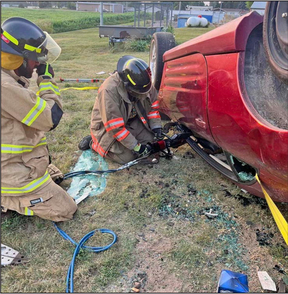
Tanner Pehrson and Cody Berndt work on cutting a vehicle frame to do a full roof extrication at a recent AVFD training.