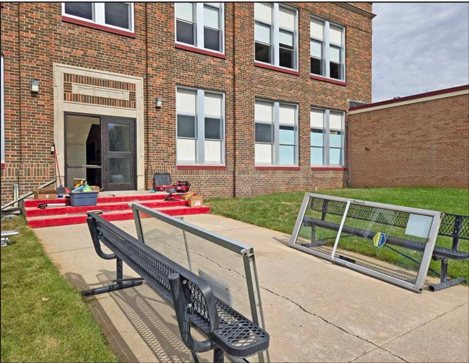
A new aluminum door was in the process of being installed on the south side of the high school Friday of last week. At this stage, all but a couple of the exterior doors on school grounds had yet to be replaced, with controlled access in the early stages.

THURSDAY, SEPTEMBER 26, 2024 CUSTER COUNTY, ARNOLD, NEBRASKA 69120 (USPS 032480) SINGLE COPY: 75 CENTS VOLUME 108, NUMBER 16