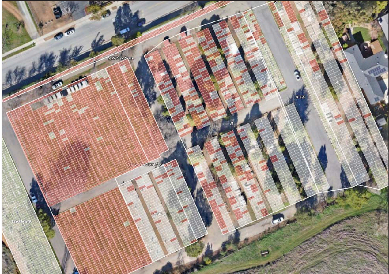
Sample of another cemetery using digital mapping. Each individual plot will be marked on the map and color coded to reflect its status, such as occupied, unoccupied, or for sale. It will also be able to generate a printable map.