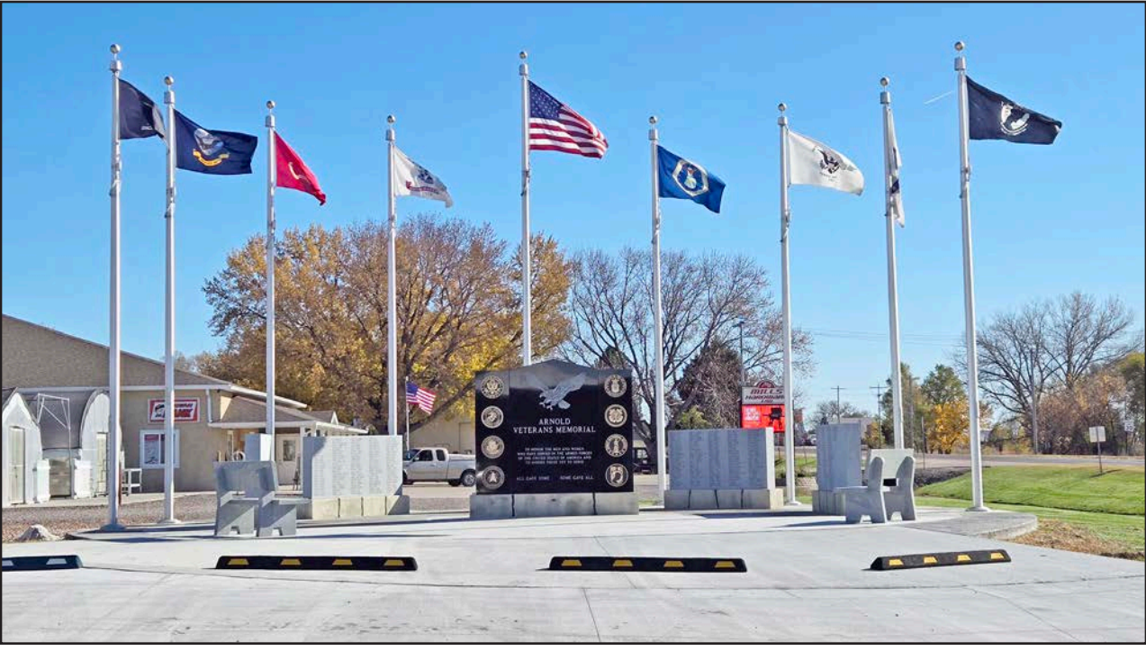
From September 2024 and into 2025, The Sentinel tracked the progress of the Veterans Memorial project, phase by phase, until Legion and the community celebrated its completion in October.